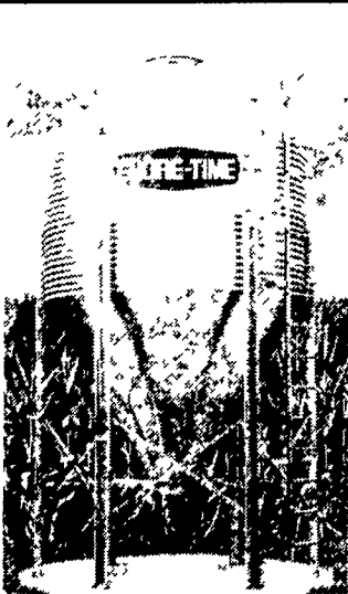
Call for pricing on bins assembled and delivered to your farm