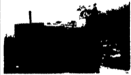
'76 INSLEY 1500B HYDRAULIC EXCAVATOR, All Pumps Rebuilt, Detroit Engine Excellent Undercarriage 17' Yd Escalator Bucket, 74,000 lb Machine, New Paint, Very Good Condition, Free Delivery Up To 100 Miles, $17,000