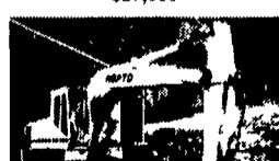
'79 HOPTO EXCAVATOR, Model 211, 36" Bucket 30' Triple Grouser Pads, New Undercarriage, 4-71 Detroit Engine with 300 Hours on Rebuild, 52,000 Lb Machine, Very Good Condition, Free Delivery up to 100 Miles $19,900