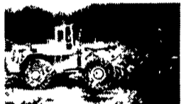
'80 72-71B TEREX LOADER, Completely Rebuilt Engine, New Cat Bucket (8 Yd ), Good Rubber, Very Good Condition, Free Delivery Up To 100 Miles, $28,000