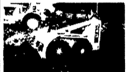
'86 BOBCAT 743 DIESEL, New Paint & Tires. Work Ready, Excellent Condition $7,500

R.R. #1, Route 118 Sweet Valley, PA 18656-9608 717-477-2224