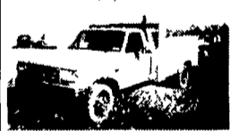
'89 FORD F-450 SUPER DUTY, Mechanics Truck 7 3 Diesel 5 Spd 14,500 GVW 9 Utility Body 2 Alum Diamond Plate Cabinet For Torches Air Compressor Or Whatever Good Tires Very Good Condition $10,500