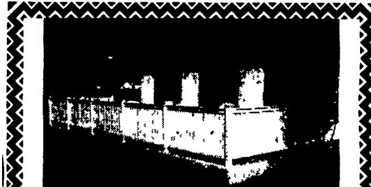
Maintenance Free Railings For Porches, Decks or Balconies