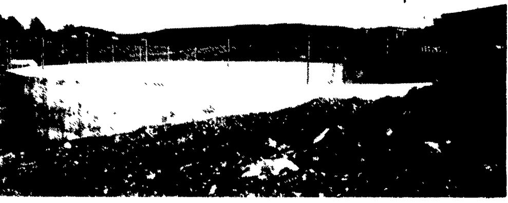
12' x 83' Diameter Circular Manure Storage

Specializing In Manure Storage Round or Rectangular, In-Ground or Above-Ground