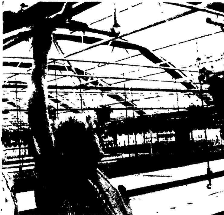
Donald Layser activates an overhead irrigation system in one of the greenhouses.

She said, "We may not be number one (in the state) in production, but we are growing in end use, in consumer use, of products."