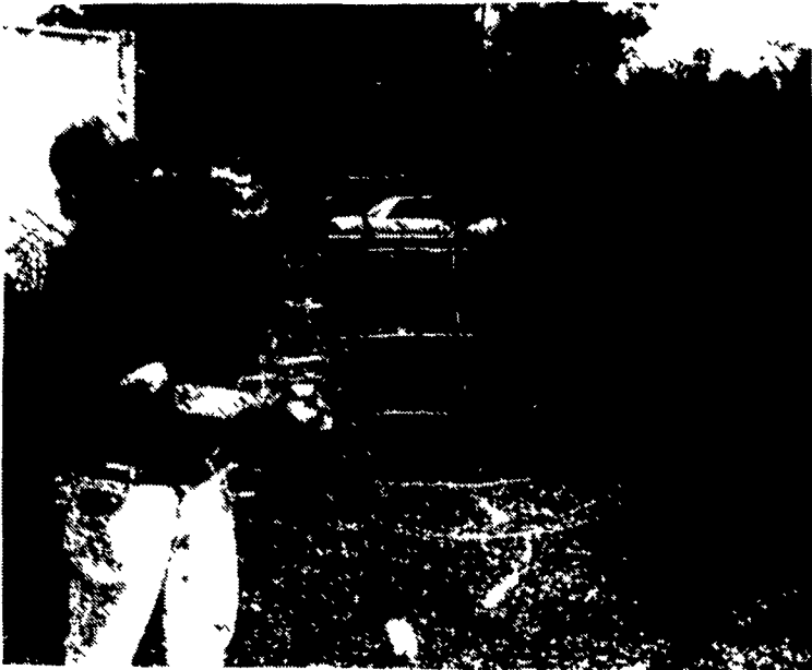
Once the tree is dug, it is placed in a specially designed wire basket that can hold a few hundred pounds of soil with a burlap bag. The rungs at the top of the wire cage are used to tie the tree down after planting. Larry Knoll, farm manager, holds up one of the cages.