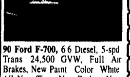
90 Ford F-700, 6.6 Diesel, 5-sp Trans 24,500 GVW, Full Air Brakes, New Paint Color White All New Tires, New Brakes, New Service, New Tune-Up PA State Insp

I'm Completely refurbished from front to rear! The one way you can replace me is to buy new! 86 GMC w/Thiele 8 1/2' Dump Bed