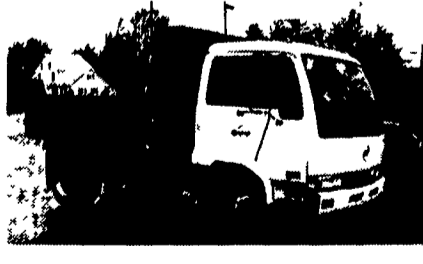
1998 UD 1800 With 10ft. Dump Body