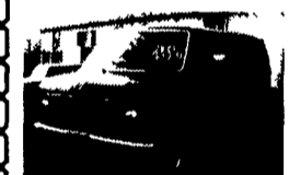
1985 Ford E-350 Cargo Van 6.9 Diesel Engine Automatic 9 300 lb GVW Excellent for Carpenter Painter or Plumber Color Blue PA State Insp