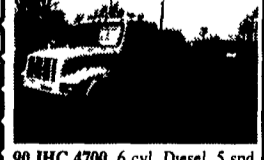
90 IHC 4700, 6 cyl Diesel, 5 spd Trans, 25,500 GVW, Original Miles 219 825, New Paint, New Service, New Brakes New Tires Color, White PA State Insp