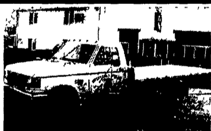
1990 Ford F350 14 ft. Alum. Stake Dump, V8, At, New Inspection, 90,200 Miles $9,500