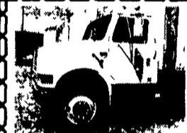
1991 IHC 4900 GVW 32 500 Budd Wheels DT 466 Eng 210 HP 6 Speed Trans Air brakes New Paint White

Before you sell or trade your diesel in somewhere else for LESS. CALL US! We Pay More for Used Diesel Trucks Than Anyone. TRY US! 717-949-2000 or 610-678-3243 Ask for Smokey or Kay KELLER BROS. RD 7, Box 405 Lebanon, PA 17042