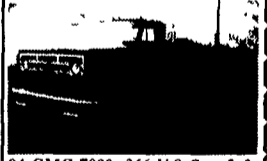
84 GMC 7000 366 V-8 Gas 5+2 spd Trans Hyd Brakes, New Paint Color Red 28 000 GVW 108 184 Original Miles, New Tuneup New Service, New Tires, New Brakes PA State Insp