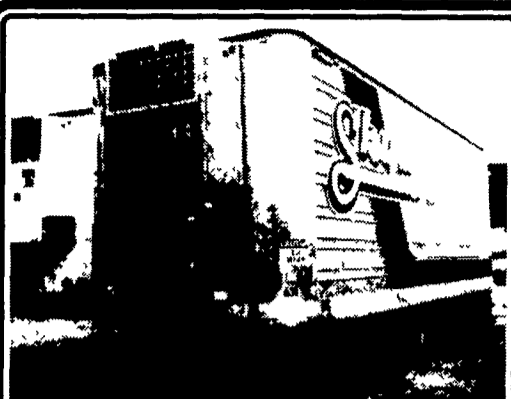
45 ft Reefer Trailers Bargain Time

UTILITY TRAILERS: 1982 5 1/2' x 9 1/2' tilt bed, 4500 GVW, Surge brakes, $950; 1986 5 1/2' x 13' open center bed, 8300 GVW, Surge brakes, $1500. Weaver's Sales & Rentals (Berks) 610/682-2215.