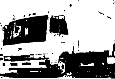
'97 & '98 UD 1400 & 1800, 16' & 18' Van Bodies and Cab & Chassis Avail. - Call for Details -