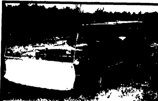
INTERNATIOAL SCOUT II '79 4x4, 345 Engine, Auto, PS, PB, AC, Cruise, Am/Fm Cassette, w/Myers snow plow Pr. angle. $2,900 301-776-6622

Special built truck body to haul small dozer or backhoe. 610-252-7292