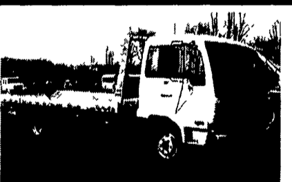
1998 UD 1800 Loaded Danco Rollback, Wheel Lift - Call for Details -