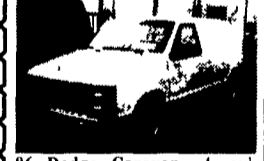
86 Dodge Caravan, 4 cyl Automatic Gas, 4 810 GVW 125 318 Original One Owner All New Brakes, New Tires New Tune-up New Service New Shocks A-Arm Bushings New Muffler Rebuilt Trans New Windshield, New Paint Color-White, No Windows, PA State Insp