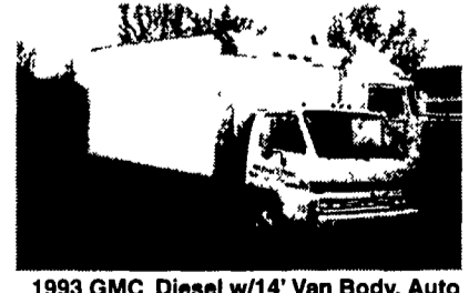
1993 GMC Diesel w/14' Van Body, Auto Trans, AM/FM $9,200