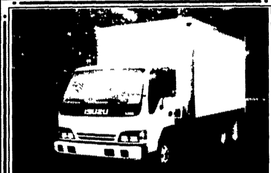
Almost New - Must Sell 1998 Isuzu NPR, 5 Speed Trans., 14' Morgan Box with 2000# Maxon Lift Gate, 14,250 GVW, AC, AM/FM Cassette $29,250 Call (717) 694-3107