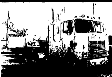
(1) 89 & (1) 91 International 9670 Cab Overs, Cummins Diesel, 9-Spd. Trans, Call for Individual Specs. $9,900

I'm Completely refurbished from front to rear! The one way you can replace me is to buy new! 86 GMC w/Thiele 8 1/2' Dump Bed