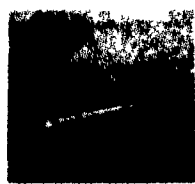
Before The bottom part of the stave's are completely worn away