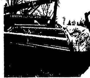
NH 499 12 ft. Hydro Swing Haybine, Nice, Choice of 3 Was $7,950