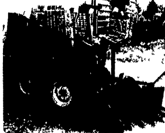
Gehl 3510 27 HP Gas Skid Loader, Good Tires, 2 Buckets, Was $7,450

Water Level Is Coming Up - Our Prices Are Going Down! Need to Clear The Lot - Before The Water Gets Too Deep The Early Bird Gets The Worm -