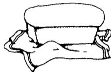
Makes 1 loaf.

cooled to lukewarm, add dissolved yeast and flour. Knead well, cover, and let rise in a warm place overnight. In the morning, shape into a large loaf and bake at 375° F for 20 minutes. Reduce heat to 350° F and bake another 40 minutes.