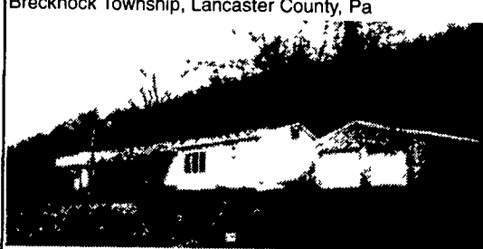
11/2 acre lot with

Located along Orchard Road just off Bowmansville Road approx 2 miles north of the village of Bowmansville in Brecknock Township, Lancaster County, Pa