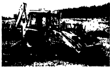
88 JCB 1400B, 4x4 Cab, 3000 One-Owner Hrs., Good Rubber.... $19,500