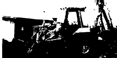
89 Case 680L 4x4, Cab, Ext. Hoe, 2800 Hrs., Good Rubber, New Paint..... $34,000