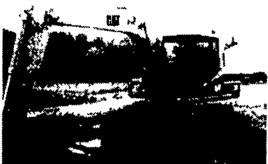
Fiat Allis 645 SOLD .....$15,500 Case 580C, Ext.Hoe, 3900 Hrs.$12,500 Komatsu D20A Crawler Tractor, 6-way Blade, 1900 Hrs.....$12,500 Hitachi EX60 Excavator, 3300 Hrs.....$22,500 Ford 555 TLB, O-ROPS, Good Rubber .....$12,900