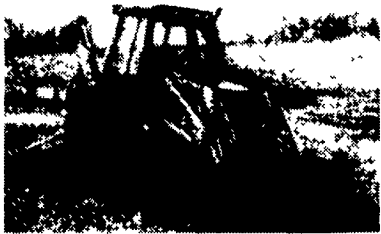
94 Case 580 Super K 4x4, Ext-Hoe, New Rubber, 3300 Hrs, Wobble Stick Controls....$34,500