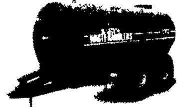
VanDale 3300 Slinger Rental Unit. 3 pt. Hookup

INT: 5088 w/cab; 3230 w/loader; 3088; 1486 w/cab; 1130 4WD w/loader; 1120 4WD w/loader & mower; (2)1086 w/Cab, 986 w/cab; 885 w/canopy; 886 w/cab; 766; 686; 684 w/loader; 685 4WD w/loader; (2) 400; 354 w/loader; (2) 300; 585 4WD w/loader; 560; 460; 186 hydro w/cab. JD 2940; Towmotor forklift; 4600 SU w/loader; Bobcat 743 skid steer; JD 310A backhoe loader. Round Balers: NH 855; 852, 853, NH 850, JD 430, Case IH 3440, Case IH 8450; (2) NI 484. Square Balers: IH 430 w/thrower; JD 337 w/thrower; NH 315 w/thrower; JD 24T w/thrower Hay Rakes: NH 256, NH 56; JD 640; NI Haybines: NH 488; NI 5109 Misc.: IH 2000 loader; IH 2350 loader, Reo spreader truck; JD 4400 combine. New Farmco Hay Wagons Farmco Feeders, Tedders Hurst Trailers From LEADER'S FARM EQUIPMENT Everett, PA 814-652-2809 Closed Sundays & Mondays All Types Of Farm Equipment Call before you come