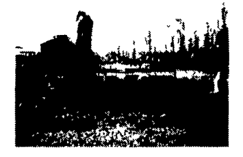
Woods S 260 3 pt. Side Mount Rotary Cutter w/Dollie Wheel.