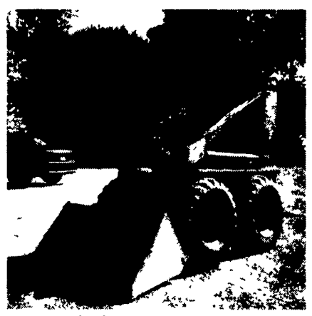
1816C Case, 43" bucket, 16hp Onan, 700 lb lift $4,900