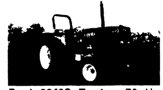
Ford 6640S Tractor, 76 Hp Powerstar Engine, Sharp

TRACTORS & LOADERS Ford 8670 4WD Tractor Hydramac 8C Skid Steer Ford 5000 Gas Ford 650 Gas Ford 1520 23 HP 4WD Ford 841 Gas Ford 5000 Tractor w/ Cab Ford 6610, 72 HP Ford 6640S, 76 HP Ford 655 TLB 4WD, Cab w/A/C Ford 345 C w/Loader Ford 550 TLB, 2WD, Cab Ford 777 B Loader Attachment NH 425 Skid Steer, Gas NH L455 Skid Steer NH L553 Skid Steer (2) NH L555 Deluxe Skid Steer (2) NH L785 Skid Steer AC 5040 Tractor AC 6080 w/Loader Bobcat 641 skid steer Case 580B Tractor Loader Case 1835-B skid steer Deutz 1920 L&G Tracto w/60" Deck Int. 656 Gas Tractor JD F912, Frt Cut Mower w/60" Deck Mitsubishi 650G Tractor w/ Front Blade Yale Forklift, 5000 Lb Lift