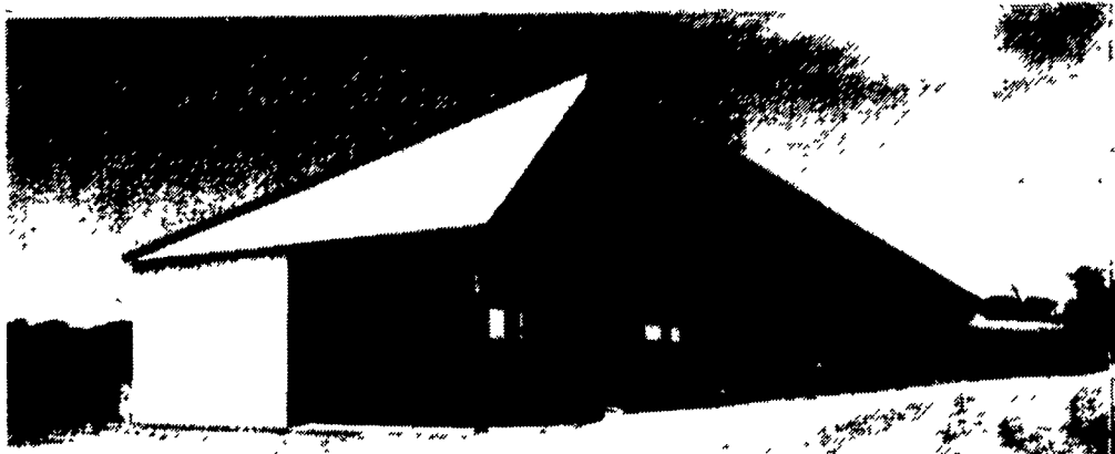
Virginia Style Heifer Barn With 8' Deep, 180' Long, 12' Wide Slatter SCS Approved Concrete Manure Pit

Specializing In Manure Storage Round or Rectangular, In-Ground or Above-Ground