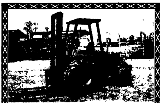
Case 586 Forklift, Rebuilt Engine $9,000

Water pump, 5hp 2" high pressure Northern Hydraulic #10997-C126 $300. Twenty 2'X50' hoses $10 each. Sussex County, NJ 973-827-1627.