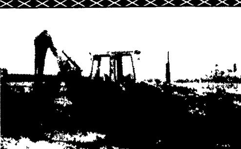
Ford 555 Wheel Loader Backhoe, EROPS $13,000

Heavy Equipment Loader Parts, Inc. 10070 Allentown Blvd., Grantville, PA 17028 (717) 469-0039 (800) 446-0505