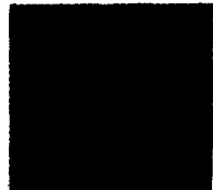
After With the hole repaired by Shotcrete and a new surface applied, the silo is ready for years of use