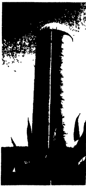
"This is the kind of silo you need to protect your valuable feed."

"HOW WILL YOU BE STORING YOUR VALUABLE FORAGES AND GRAINS IN THE 21ST CENTURY?"