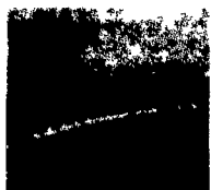
Before The bottom part of the stave's are completely worn away