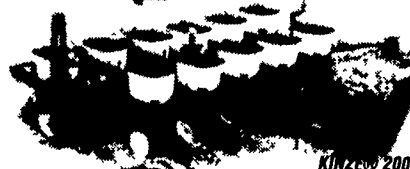
KINZE® 2000 Pull Type Planters.

We Sell Complete Replacement Row Units At Our Parts Dept.