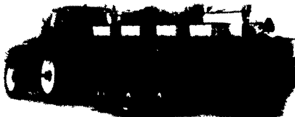
KINZE® 2500/2600 Twin-Line® Planters.

Binkley & Hurst offers a Host of Replacement Planter Parts and Accessories for Many Older Planters, All Types Of Openers & Closers, Box Toppers For Increased Capacity.