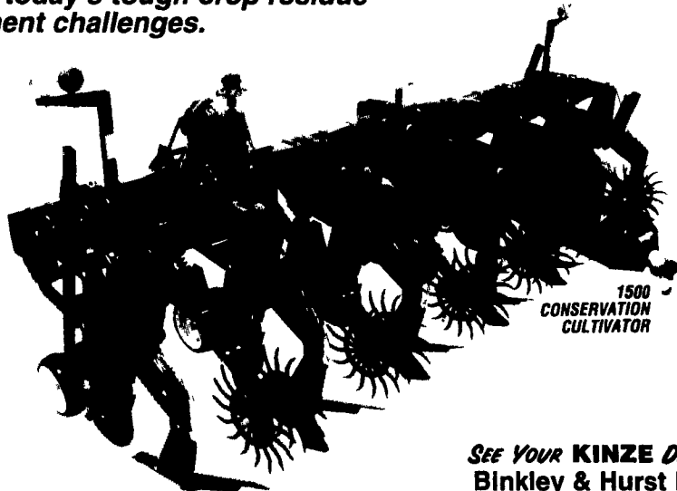
1500 CONSERVATION CULTIVATOR

Cut the weeds! Keep the cover! The new KINZE 1500 Conservation Cultivator gives you the speed, strength and options to handle today's tough crop residue management challenges.