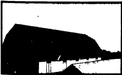
Use on Barns Or Garages