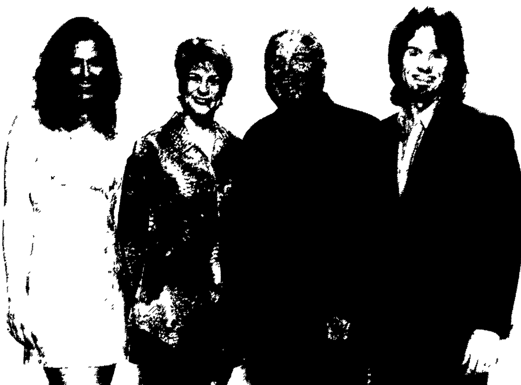
Industry members can celebrate their accomplishments with dinner and entertainment at the annual Pennsylvania Poultry Federation Fundraising Banquet at the Hershey Convention Center. This year's entertainment features the legendary American folk/pop band The Mamas and the Papas from the '60s, with such hits as "California Dreamin'," "Monday, Monday," "Dream a Little Dream of Me," and "San Francisco."