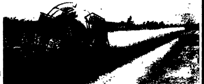
Tube-Line wrappers for all round bales or large square bales are available in either manual or fully automatic models.

Long stem silage is better used in the animals digestive system. Feeding high quality haylage from wrapped bales can reduce or eliminate feeding grain while retaining or increasing weight gains or milk production.