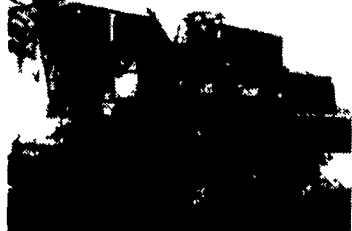
1990 MF 8460 Combine with Hillside Cleaning, 20 Ft Floating and 6 Row Corn Head, 2189 Hrs $67,000