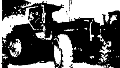
MF 3680 4x4, 160 HP $34,000