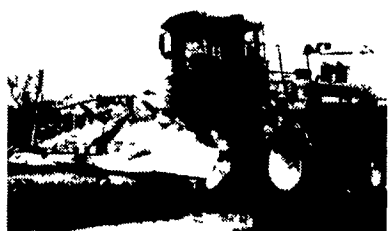
Just Traded - 96 JD 6710 Harvester 4x4 Corn Cracker Hay Head, 4 Row Kemper, 509 Hrs $148,000