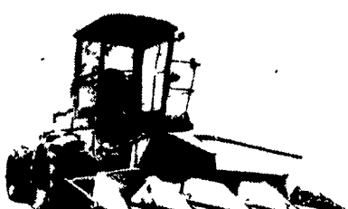
JD 5730 1991 4x4 Corn Cracker, 4 Row Corn 7' Hay $77,000