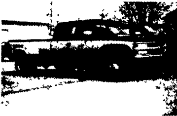
94 Chev 3500 Silverado, Ext-Cab 4x4 Dual Wheels 6.5 Turbo Diesel, AT AC PWDS PDLs Loaded, Pwr Seat, 10,000 GVW 4.10 Limited Slip Rear Blue & Silver Clean Truck 80,000 Miles $19,400