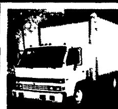
1995 ISUZU NPR 14' Van Body, 4 Cyl. Turbo Diesel, Automatic, 14,250 GVW, Clean $16,500