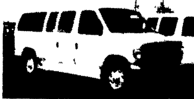
1996 Ford E350 XLT 12 Pas 351 V8, AT/OD, Dual A/C & Heat, Privacy Glass, Tilt, Cruise, PW/PB, PL, 44K mi #2587