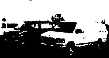
(2) 1997 Ford E350 XLT 15 Pas V10, Auto/O, Dual Air & Heat, Tilt, Cruise, PL, PW, Privacy Glass, 14K & 25K Mi