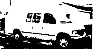
1995 Ford E250 Super Cargo Van, 300 6cyl, AT, PS, PB, A/C, 68K Miles, #2593