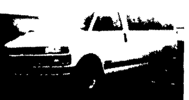
1997 Chev Express 1500 LS, 8 Pass, 350 Auto/OD, Dual Air/Heat, PW, PL, P Mirror, Tilt Cruise, Pri Glass, Dual Airbags #2571