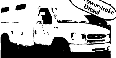
1997 Ford E Super Duty, 12' Stahl Utility Body, PS, PB, AT/OD, A/C, 14,050 GVW, Only 4,000 Mi! Rare Find #2603