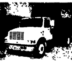
1992 IHC 4700 14' Flatbed Dump, DT360, 5 Speed, PS, 130K, 25,500 GVW $19,500