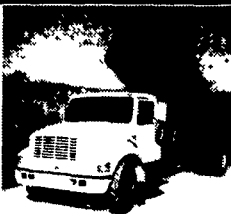
1993 IHC 4600 20' Flatbed Dump, 7.3L Diesel, 6+1 Trans, PS, Bench Seat, 25,500 GVW, No CDL $16,900

SERVICE & SALES Is A Manufacturer Of Custom Tarps • Systems • Load Straps • Tarps • Gloves • Storage Cover • Used Railroad Ties 1-800-798-TARP (8277) FAX 717-435-0036 717-435-0752