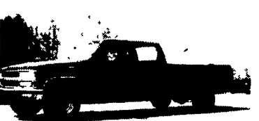
94 Chev 3500 Cheyenne, Crew Cab 350 F1, AT, AC, AM-FM, 9,000 GVW 4.10 Limited Slip Rear Local One Owner, Maroon, 123,000 Miles $12,500