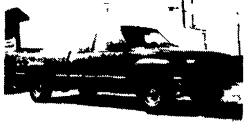
97 GMC SL 2500 Ext Cab 4x4 350 Vortex Eng AT AC AM FM Cass Cruise Tilt 373 Limited Slip Rear Local One Owner 28,000 Miles Green $22,900