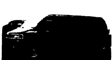
1996 Chev Express 2500 LS, 8 Pass, 350 AT/OD, Dual Air/Heat, PW, PL, Tilt, Cruise, Pri Glass, P Mirror, Cassette & CD, Dual Airbags, 8k Miles #2609