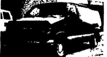
1996 Ford E150 Chateau, Quad Captains, Sofabed, 351, AT/OD, Dual A/C & Heat, PW, PL, PB, Tilt, Cruise, 57K Mi Also, 302 Available

Specializing In Vans 30/Four Way Auto Sales 770 W. Main New Holland, Pa. 17557 717 354 3199 717 355 0625 FAX Toll Free 1-888-847-8029 Many Other Vans In Stock