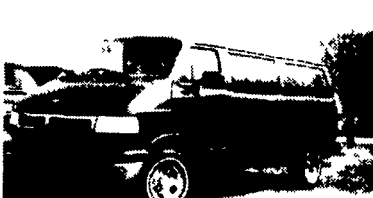
1997 Dodge B2500 SLT, 8 Pass, 318 Magnum Auto/O, Dual Air & Heat, Tilt, Cruise, PL, PW, 27K Miles #2599