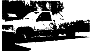
88 GMC 2500 SL, 4.3 F1 5 Spd, PS, PBS, Sliding Rear Window 7200 GVW, Clean Truck 55,000 Miles Local One Owner, Silver $5,900