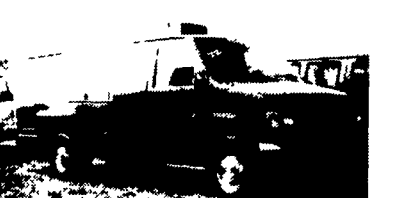
1997 Ford E350 Super Cargo w/reefer insert, Auto/O, PS/PB, 9400 GVW, Thermo King reefer w/elect standby, 30K Mi #2614