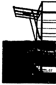
Unique Rear Unloading