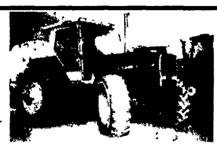
MF 3680 4x4, 160 HP $34,000