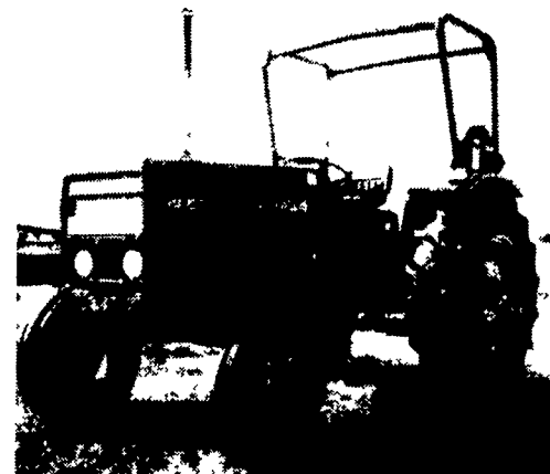
NEW Agco 4650 Tractor $13,995