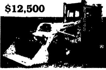
'84 JD 540B Cable Skidder, 65% Rubber