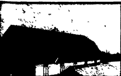
Use on Barns Or Garages