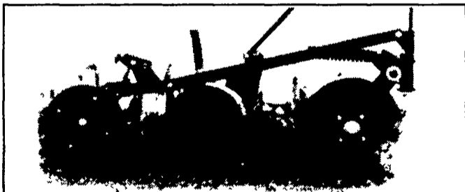
The proven Great Plains no-till system utilizes a coulter to prepare a mini-conventional seedbed for the openers to place the seed ... at the precise depth selected.

The Most Comprehensive Set of Time-Proven No-Till Drill Features In The Business