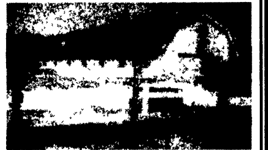
34'x84' Barn with hay storage, tack room, 12'x12' stalls