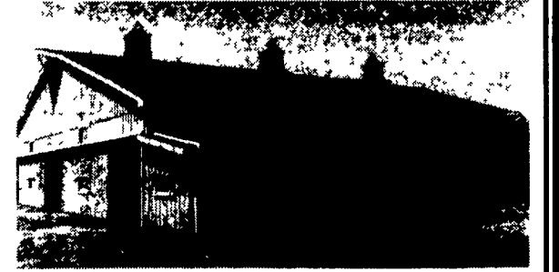
80'x100' Indoor Arena w/2 rows of 10'x12' stalls & tack room

Different Styles & Sizes Available Call for Special "Spring" Pricing