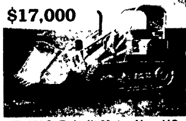
JD 450C Rebuilt Motor, New UC