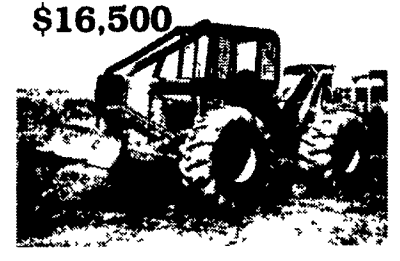
'84 JD 540B Cable Skidder, 65% Rubber