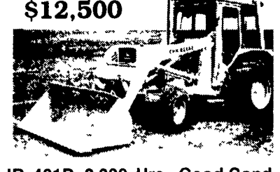
JD 401D, 2,200 Hrs., Good Cond.