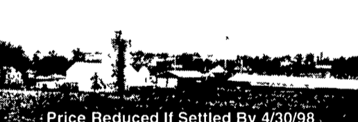
Price Reduced If Settled By 4/30/98

Presently In Operation - Can Be Bought Turn Key! 73 Acre Limestone Soils Capacities 400 Sows - 1100 Head Finishing Barn 150 Head of Beef (80 Bunk Feeder) 2 Large Concrete Silos 44x410 Bldg w/Pullet Cages Beautiful Dwelling - 2700 Sq Ft Limestone Home w/Attached 3 Car Garage Large Workshop & Equipment Bldg & Grain Storage All Very Nicely Blacktopped Set Back in w/Stream Call today for more information and private showing Franklin Co. Dairy Farm