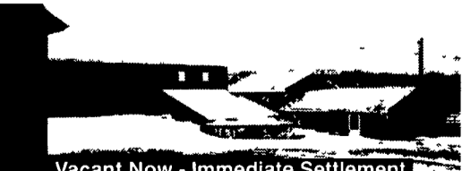
Vacant Now - Immediate Settlement

New 1600 gal Muc licr tank & milking parlor - Alpha Laval Equip - Rolling terrain suitable for intensive grazing 3 Streams 2 Ponds 2 1 ram Dwellings 40x90 new equip shed & corn barn New Roof & Siding on 3 Bay Bank Barn also nice horse barn