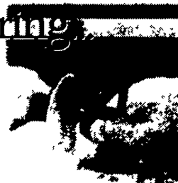
Better Growth With Chore-Time's Nipple Drinker