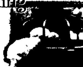
Chore-Time's MODEL C2* Feeder For Improved Conversion