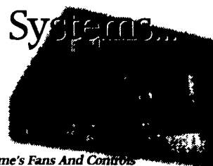
Chore-Time's Fans And Controls Offer Efficient Performance

Here are just a few of the reasons to choose Chore-Time for your next feeding, drinking, or ventilation system: