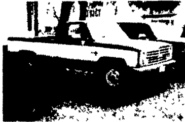
86 Chev C30 Silverado, 350 Eng, AT, AC, 9000 GVW, 4 10 Rear, Local Truck, Red & White $3,900