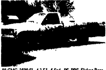
88 GMC 2500 SL, 4 3 Ft., 5 Spd., PS, PBS, Sliding Rear Window, 7200 GVW, Clean Truck, 55,000 Miles Local One Owner, Silver $5,900