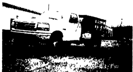
1993 Ford Superduty Stakebody