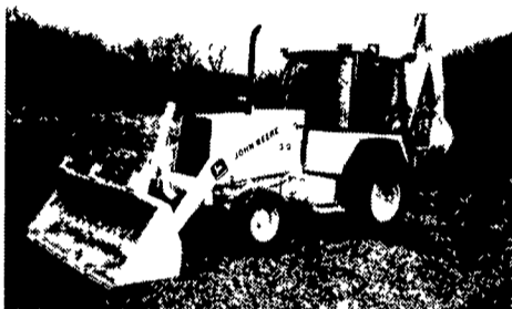
1986 John Deere 310C EROPS, 2WD

Partial Listing Only - New Items Being Added Daily