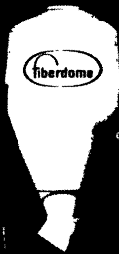
(2' - 10' Ton)

Capacities from 2.5 ton to 30 ton (Tonnage based upon 40 lb density) Industrial Bins Available