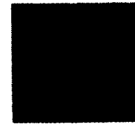
After With the hole repaired by ShotCrete and a new surface applied, the silo is ready for years of use