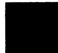
After The ShotCrete System repairs and replaces the missing structure

Just Arrived - Buy While Supply Lasts - 20'x60' Lanc. Silo w/Hanson Ring Drive Unloader, Unloaded Silo 1 time 20'x60' Ribstone w/Badger Unloader 16x60 Ribstone 12x60 Fickes 14x60 Fickes 16', 22', 24' Used Roofs New, Used & Reconditioned Silos Available We Do Silo Repair Work.