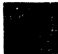
Before A hole is worn completely through the silo wall