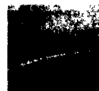
Before The bottom part of the stave's are completely worn away