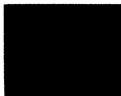
Massive 20' Auger and Forage Saw™ Knife Sections