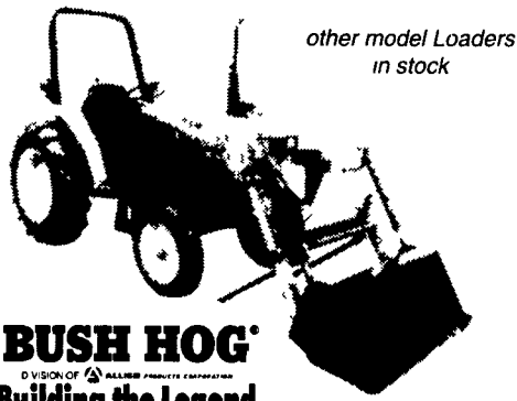
other model Loaders in stock

SPECIAL PRICE - $1,500 Base Loader, Green, Model 1845 QT mounts to fit 12 to 21 HP Tractor - 2 WD or 4 WD