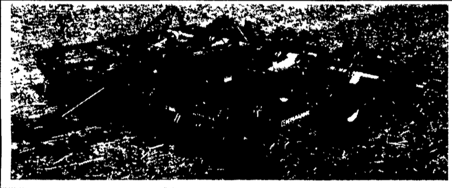
Combines Primary & Secondary Tillage with Seedbed Finishing