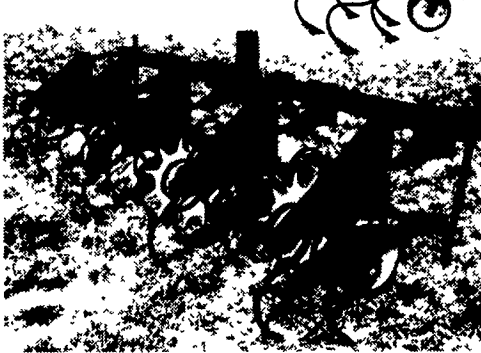
3 pt. Cultivators for 1-6 rows