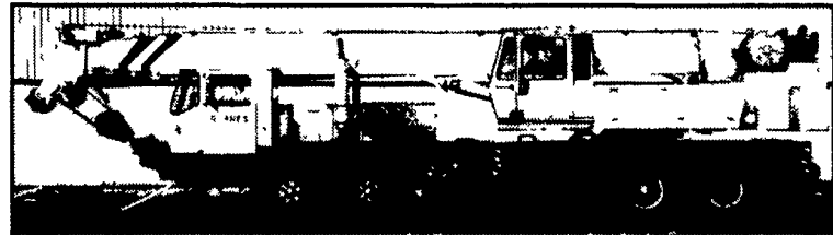
35 Ton Grove, 104' + 32' boom, 2 Winches, Cummins Diesel.... $65,000

6,000 lb. Hyster 3 Stg, S/S, Low Hrs, V Good '88 Dsl, $10,000