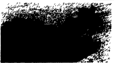
Series 5000 Field Cultivator