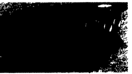
Series 6000 Land Finisher