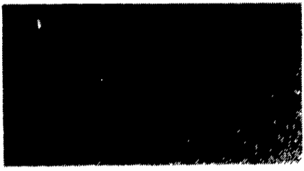
Model 1433 Conservation Disc Rock Flex Heavy Duty Cut - Plow Level and Finish