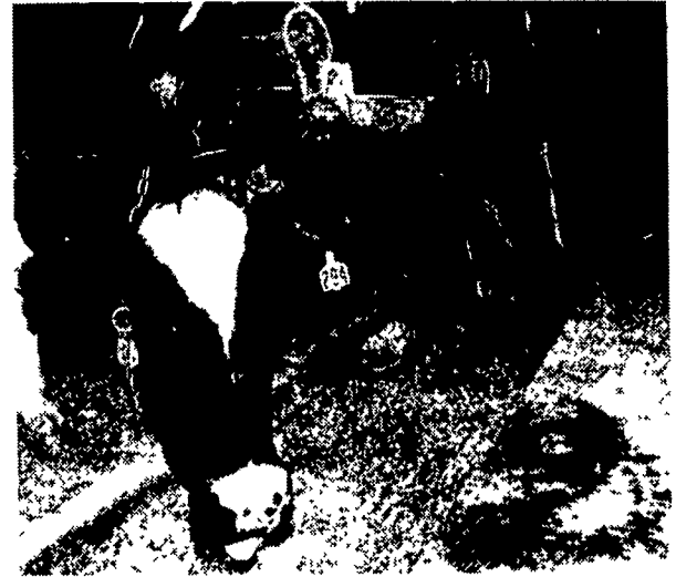
These cows enjoy Purina feeds at Abe-Mar farm.