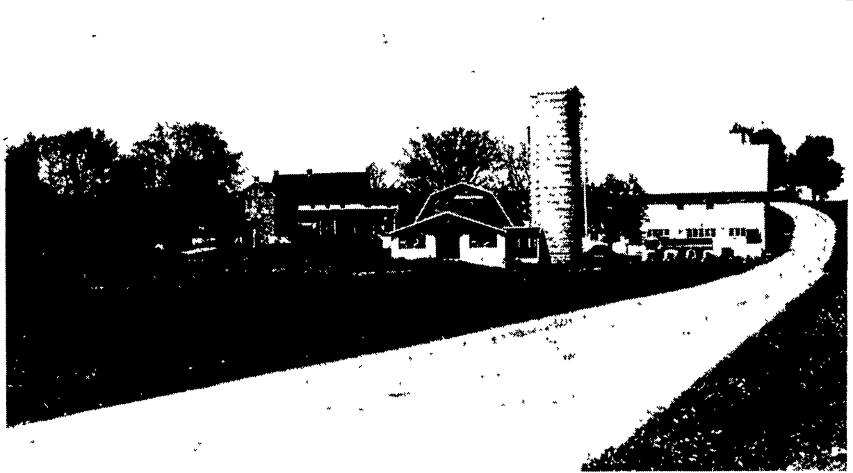
Here's a view of King Ridge farm.

Up the road at King Ridge Farm 56 homebred Registered Holsteins have a rolling herd average of 24,468m. That's up 2,313 pounds from the June ad report. Their latest daily herd average is 85.3 pounds. The feeding ration is built around flake feed and Super EXT topdress. King Ridge is a long time customer and says Purina feeds perform well. "Cows keep good body