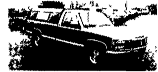
93 Chev C1500 350 V8, AT, PS, PB, only 15,000 Miles $13,495

Outten Hamburg Rt. 61, Hamburg PA 1-800-451-2333 • 610-562-2216