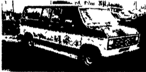
91 Ford E150 Club Wagon XLT, 351 V8, Dual A/C & Heat, Well Equipped $9,995