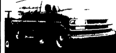
1996 Chevy Express LS 1500, 8 Pass, 350 AT/OD, Dual Air & Heat, PW, PL, Tilt, Cruise, Pri Glass, Cassette & CD, Towing Pkg, 35K Miles