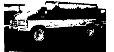
1992 Dodge B 250 LE, 8 Pass, 318, Auto, A/C, PW, PL, Tilt, Cruise, Sofabed Seats, Privacy Glass, 45K Miles