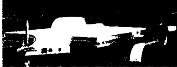
Model 3110 - All Aluminum Open Trailer, 8'6" Width x 17'6" Platform Length