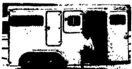
Model 9418 - 2 Horse Side By Side with Walk-Thru Manger to 4' Dressing Room