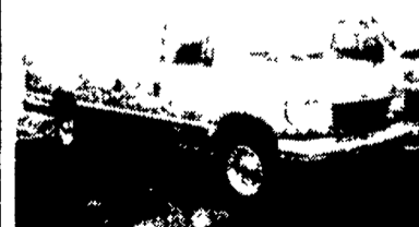
1996 Ford E350 XLT, 15 Pass, 351 AT/OD, Dual Air/Heat, PW, PL, Tilt, Cruise, Pri Glass, 22-47K Mi, (2) Available