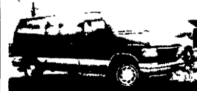
1996 Ford E150 Chateau, Quad Captain's Chairs, Sofabed Seat, 351, Auto Overdrive, Dual Air & Heat, PC, PW, Tilt, Cruise, Privacy Glass, Cassette, Power Mirrors, Power Seat, 35K Miles Very Comfortable!