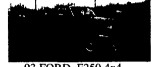
93 FORD, F250 4x4 V8, 5-Speed, A/C, Red, Snow Plow, 88,000 Miles