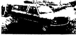
94 Chev C2500 V8, AT, A/C, Well Equipped, Matching Fiberglass Cap., 11,000 Miles $13,995