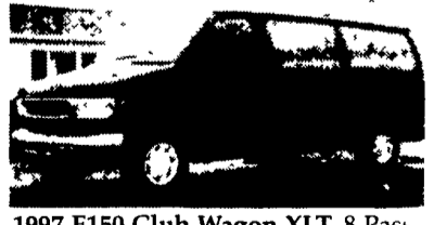
1997 E150 Club Wagon XLT, 8 Pass, 54 V8, Auto, PS, PB, Dual Air, Dual Heat, PW, PL, Tilt, Cruise, Privacy Glass, 7,000 Mi. #2586