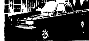
95 DODGE DAKOTA, EXTEND CAB SLT 4x4, V8, AT, A/C, 34,000 Miles, Maroon