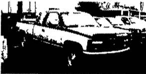
93 GMC 1500 SLE 4x4, Ext., Cab, AT, A/C $17,995