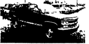
95 Chevy Tahoe LS 4x4 2 Dr., V8, AT, A/C, Well Equipped 25,000 Miles $22,995