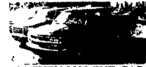
96 CHEV 2500 EXT. CAB V8, AT, A/C, 8,600 GVW, 5,000 Miles, Green