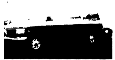
1994 Ford E150 XLT, 8 Pass, 302, Auto, Overdrive, A/C, PW, PL, Tilt, Cruise, Privacy Glass, Power Mirrors, Cassette, 47K Miles