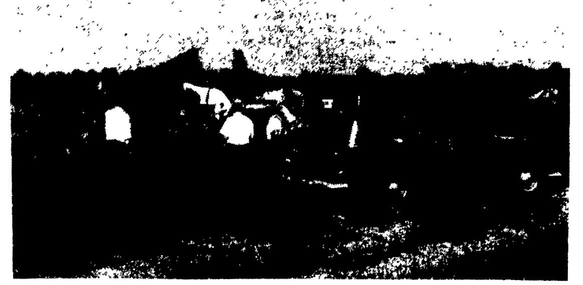
In times past, field demonstrations gave farmers up-close review of equipment operation.