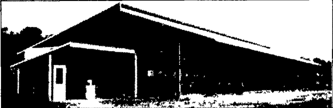
OPEN-SIDED HEIFER FACILITY