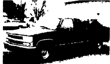
96 Chevy 2500 Silverado Ext Cab 6.5 Turbo Diesel, AT, A/C Am-Fm Cass Pwds Pdl's Pmrs, PSeat, Cruise Tilt, 8600 GVW 4.10 Limited Slip Rear Dk Blue 51,000 Miles $19,400