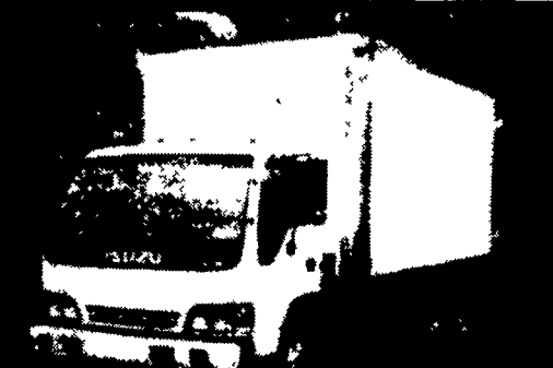
1998 Isuzu Truck NPR-ZE2, 14,250 GVW, 5 Spd., Power Steering, A/C, Am/Fm Cassette, 14' Morgan Body, Overhead Roll-up Door, Maxon 2000# Liftgate, 1040 miles.