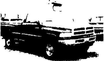
94 Dodge 2500 4x4, SLT Laramie 5.9 Cummins Diesel AT A/C Pwds Pdl's, Am-Fm Cass Pmrs 8800 GVW, 4.10 Limited Slip Rear 66,000 Miles One Owner Dk Blue $19,400