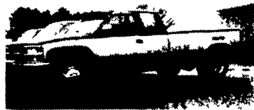
94 Chevy Dually Extended Cab 10,000 GVW Silverado 6.5 Turbo Diesel Auto Overdrive 4.10 Limited Slip Rear PS PB PW PL Cruise Tilt A/C AM FM Cas 2 Tone Blue & Silver, 80,000 Mi $19,500