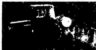
Kubota Tractor Corporation markets a full line of tractors through a nationwide network of over 1,000 dealers. Financing is available through Kubota Credit Corporation.

Visit your Kubota dealer and find out how to make your move - to Kubota country!