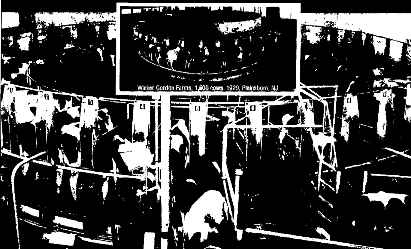
Walker-Gordon Farms, 1,500 cows, 1929, Plainsboro, NJ

It's been more than sixty years and we're still running circles around the competition.