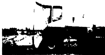
NH 1495 Diesel, Cab, Air, Hydro w/1496 Hd.