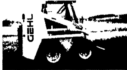
Gehl 5625 SX