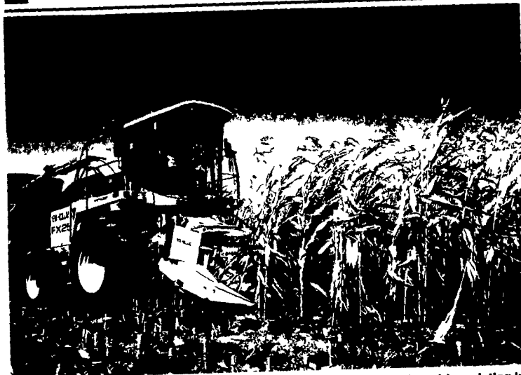
Corn yields are becoming evident as harvest is in full swing with a wide variation in yields because of weather conditions. Clarence Hoover runs the silage harvester on the John S. Nolt farm north of New Holland.