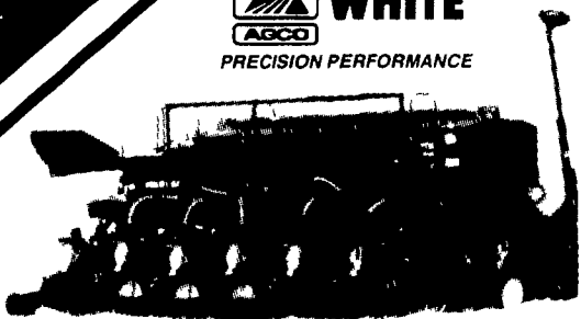
WHITE 6800 Central Fill Planters