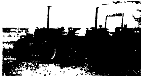
A Pair of JD 2550's