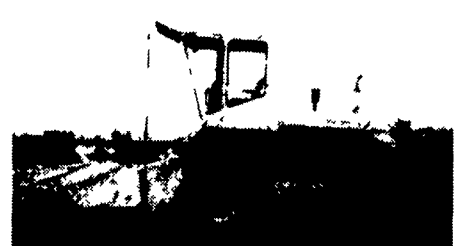
NH 1495 Diesel, Cab, Air, Hydro w/1496 Hd.